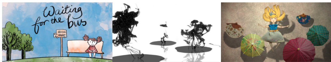
Screenshots of "waiting for the bus", "miss", "down the rabbit-hole"

During last academy year, I practiced different methods to do animation, from frame-by-frame drawing to manipulated analogue action, from linear